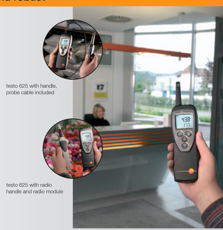
Monitors Indoor Air Quality